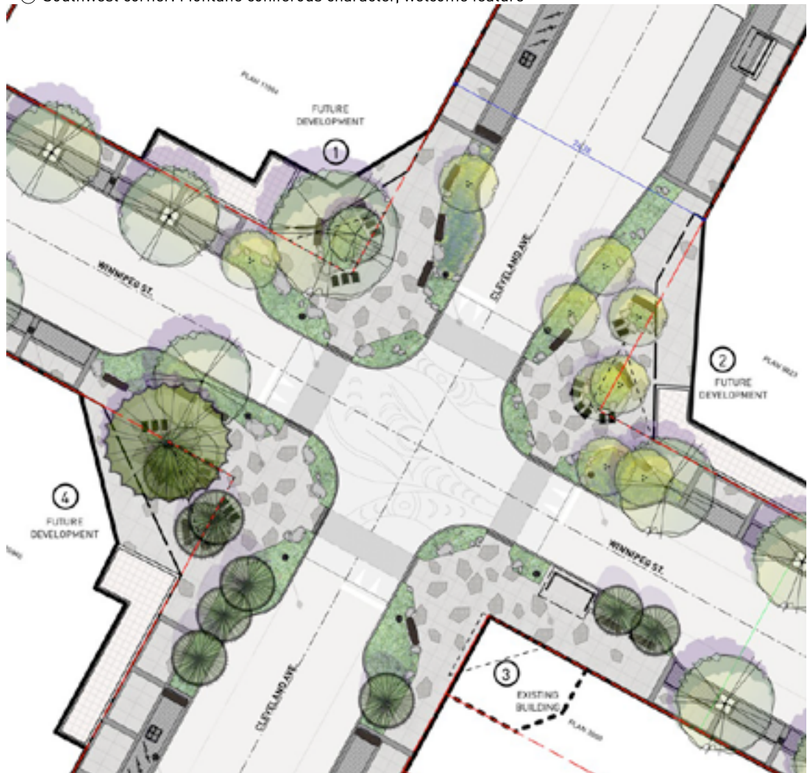
Conceptual plan for the intersection of Cleveland Avenue and Winnipeg Street. Conceptual design of intersection paving by Cory Douglas.