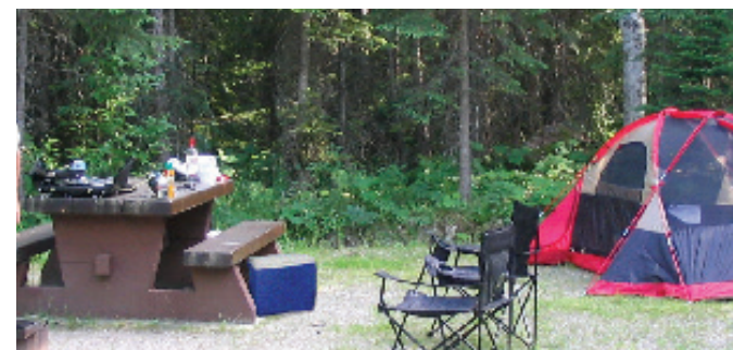
The attractants in this site include a camp stove, full cooler, drink bottles, citronella bug spray, and an open bag of candy.