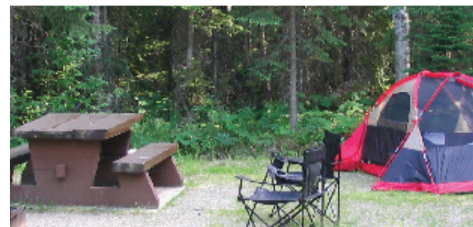
When away from your site, you may leave out camping furniture (eg: lawn chairs, lanterns, and tents)

Please report any bear sightings to the Conservation Officer Service 24/7 Hotline: 1.877.952.7277 (RAPP)