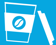
Coffee Cups & Lids

Download the Squamish Curbside Collection app or sign up for collection schedule and electronic reminders at squamish.ca/collection-schedule .