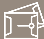
Padded Envelopes & Plastic Lined Paper