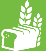
Breads & Cereals