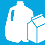
Plastic Milk Jugs & Tetra Packs