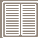
Disposable Furnace Filters