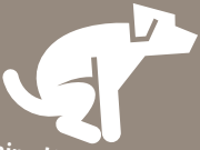
Animal Waste, Cat Litter, & Bedding