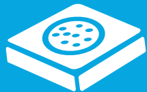
Clean Pizza Boxes