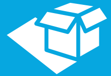
Cardboard & Paper (Flattened)