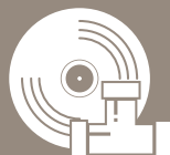
PVC & Vinyl