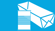
Food Cans & Single Use Baking Trays / Containers