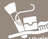
Personal Hygiene Products