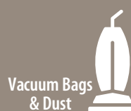
Vacuum Bags & Dust