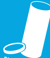
Plastic & Metal Lidded Cardboard Containers