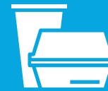
Single Use Cups & Plastic To Go Containers