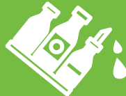
Condiment, Sauces & Syrups