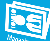
Magazines & Catalogues