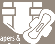
Diapers & Sanitary Products