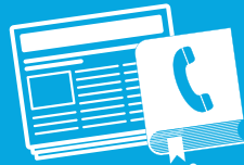
Newspapers & Telephone Books