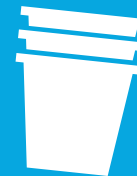
Plastic Pails, Garden Pots, & Trays