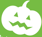
Jack O' Lanterns