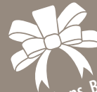
Ripped Ribbons, Bows, Gift Bags & Foil Wrapping