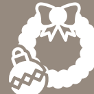
Broken Holiday Decorations