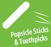
Popsicle Sticks & Toothpicks