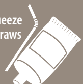
Plastic Squeeze Tubes & Straws

Download the Squamish Curbside Collection app or sign up for collection schedule and electronic reminders at squamish.ca/collection-schedule .