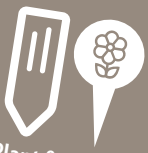
Plant & Flower Makers/Tags