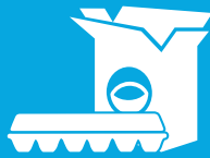
Food & Cereal Boxes