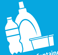
Mixed Plastic Containers