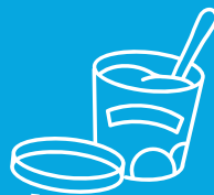
Frozen Dessert Containers